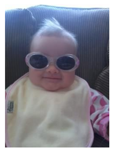
The next generation